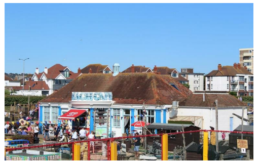
455 Hove Lagoon, Hove, BN3